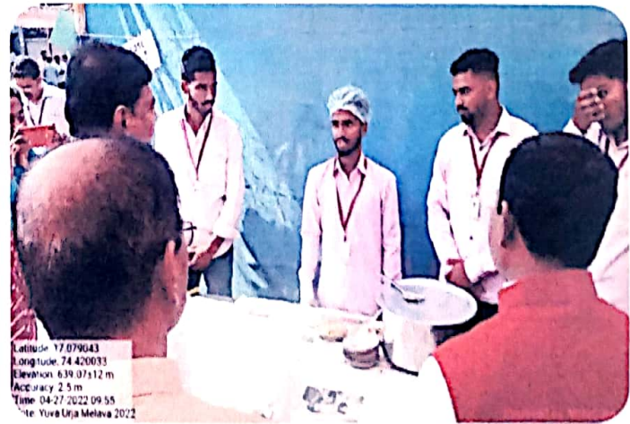
Students of the Department gave the demo of their creativity.